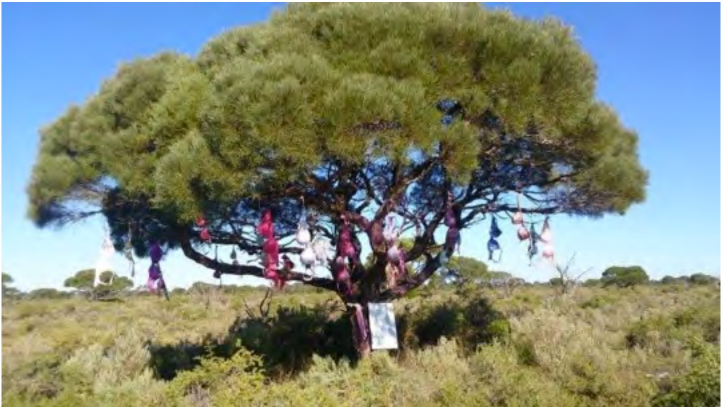
The breast cancer awareness tree - women are invited to hang their bra on the tree and post a photo on Facebook

Sue joined the other women who had participated and wrote on Facebook: