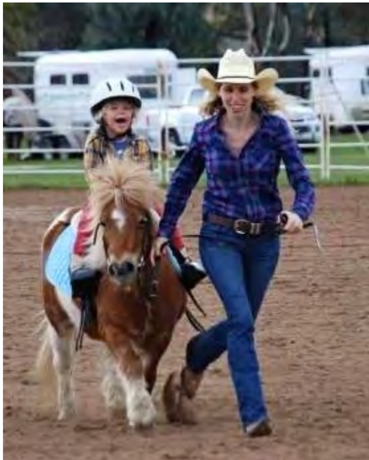
"It was a wonderful family activity, very relaxing and happy. My boys loved it as much as I did."