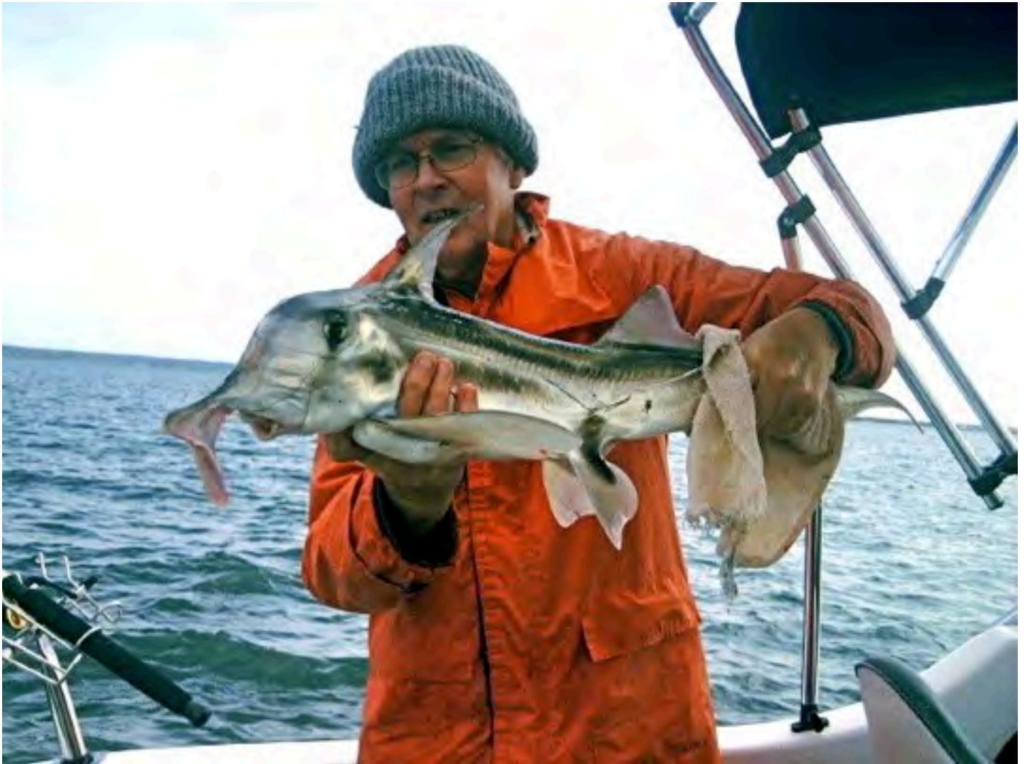
On Westernport with an "elephant shark" . Great eating