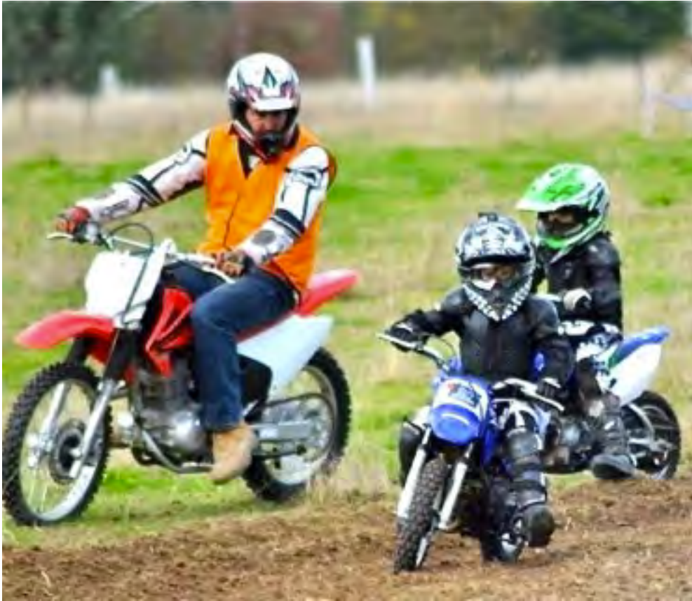
No one is too small to have a go. Dads are nearby keeping an eye on the tiny tots.