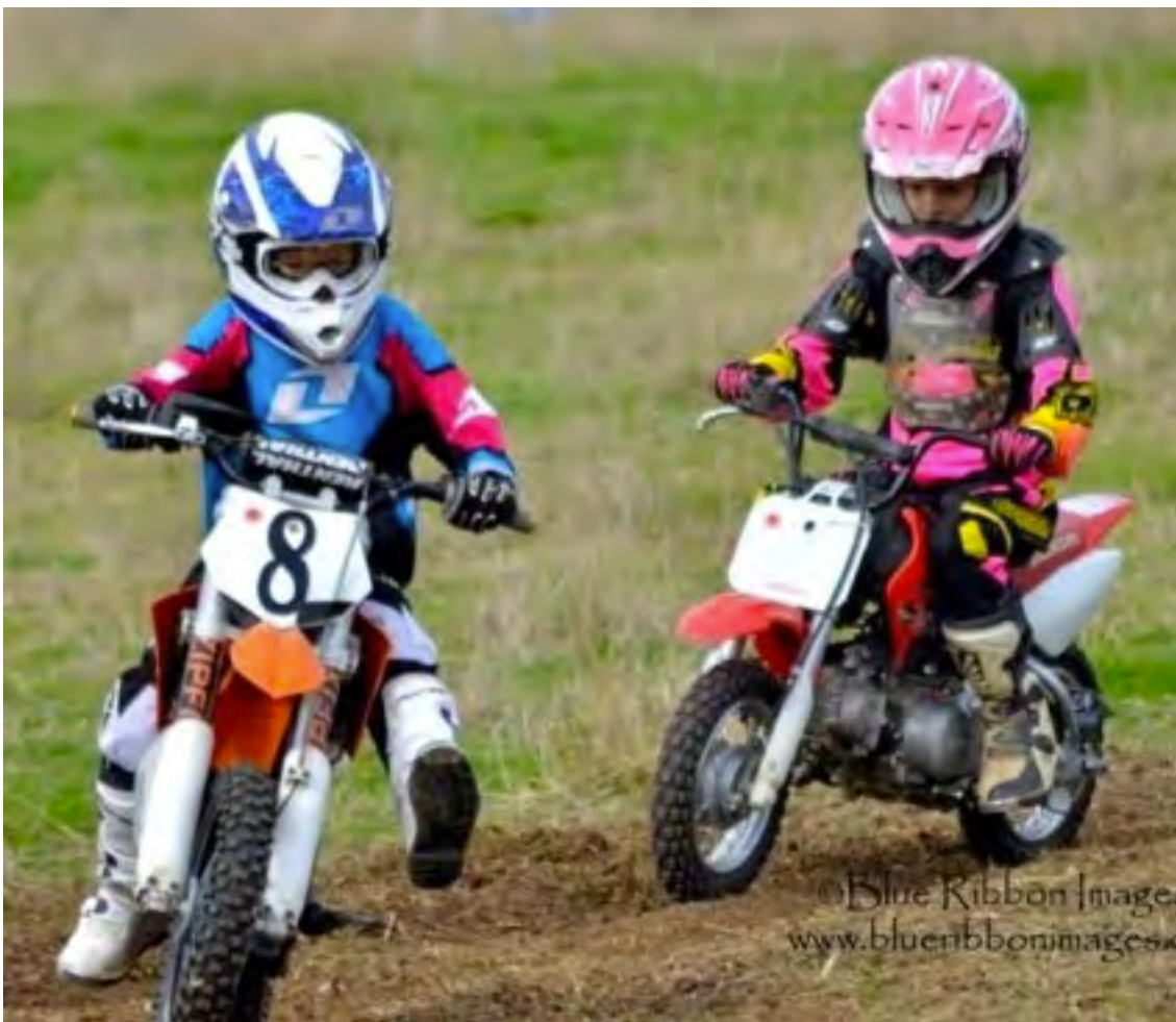
This motorbike riding is not just for the boys either