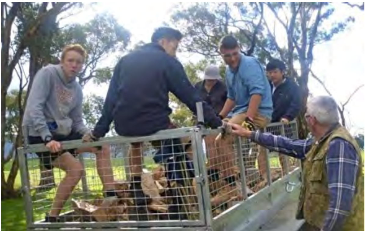
The boys jumped into the trailer to level out the load before it was taken to the house in Happy Valley.

Our final group (or so we thought) came to help with firewood for some people who are very special to me and after the first load in a loaned and manned tipper trailer; the boys really appreciated the freshly baked banana cake made by the lady of the house receiving the firewood. The boys came with their own work gloves, safety goggles and willing attitude. After a second load which was possibly even a bit larger, the householder called it quits and we returned to the house for a barbecue lunch. The boys normally would have made their own lunch, so they were really appreciative that lunch was made for them. After lunch they stacked more combustible materials on the bonfire then helped the owner of the tipper trailer get some white gum from the house paddock.