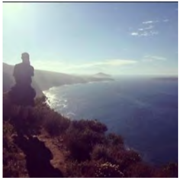
Oh what a wonderful view from Heysen Trail